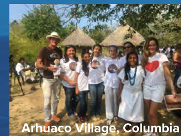
Arhuaco Village, Columbia