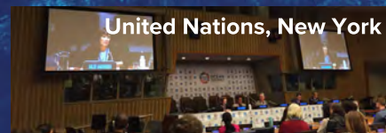
United Nations, New York