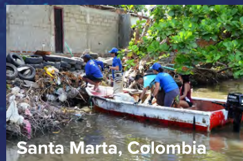
Santa Marta, Colombia