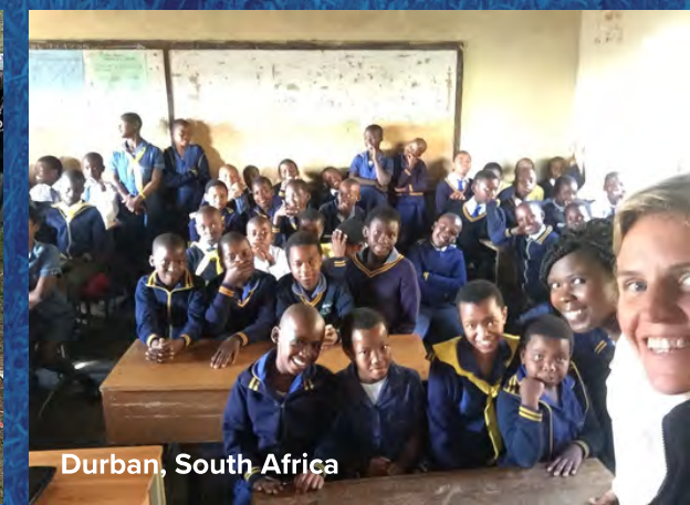
Durban, South Africa