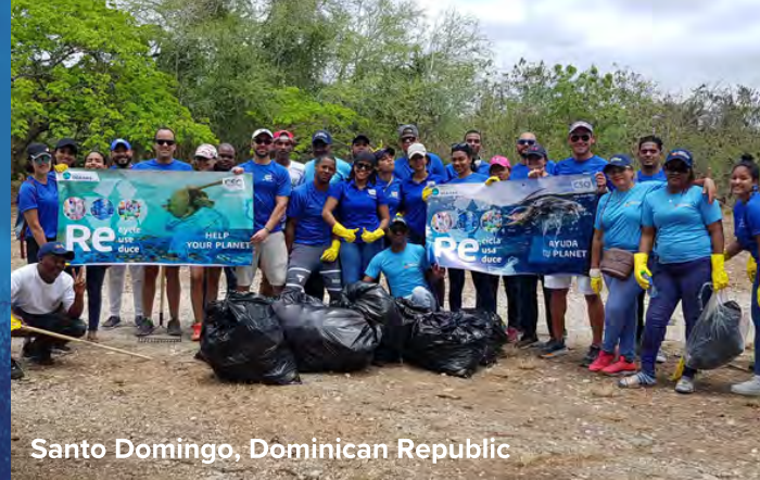
Santo Domingo, Dominican Republic