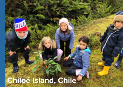
Chiloé Island, Chile